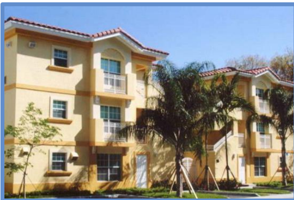
Fort Lauderdale House

In 1982, a group of caring individuals, local McDonald's Owner Operators, prominent doctors, a few corporations and volunteers raised the funds to open the first House in Miami. Jackson Memorial Hospital graciously donated the land to make this program possible. In 2004, the second House in South Florida opened in Fort Lauderdale next to Broward General Medical Center. This facility is able to accommodate up to 20 families. Broward Health, who operates Broward General Medical Center, generously donated the land and building to RMHC of South Florida. More than $700,000 were donated in construction materials, furniture and in-kind services from local businesses.